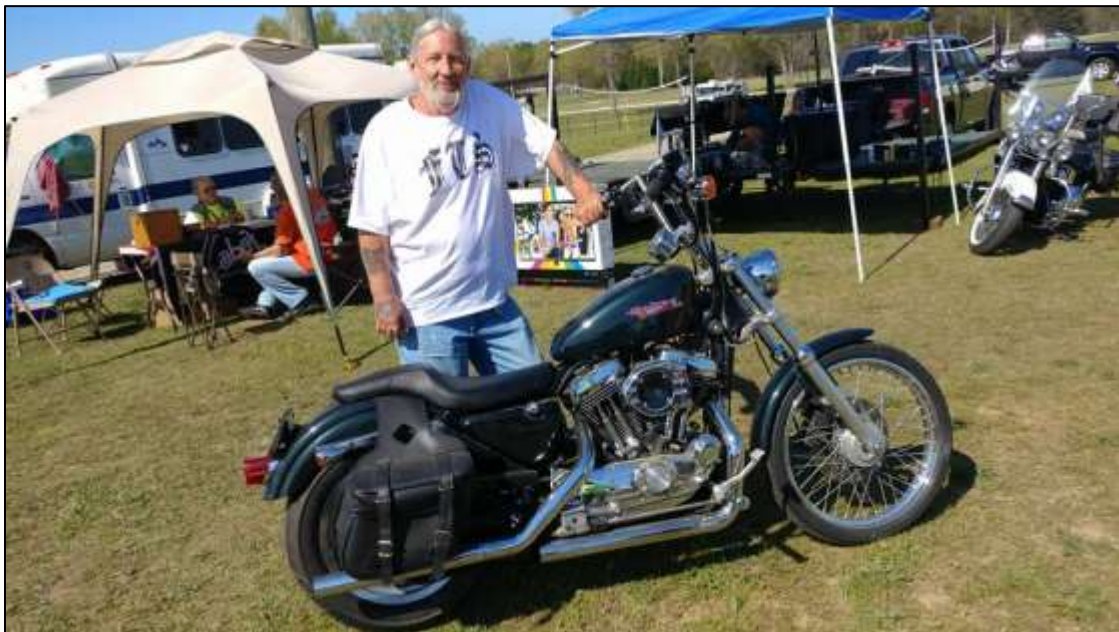
Raffle Bike Winner from D6!