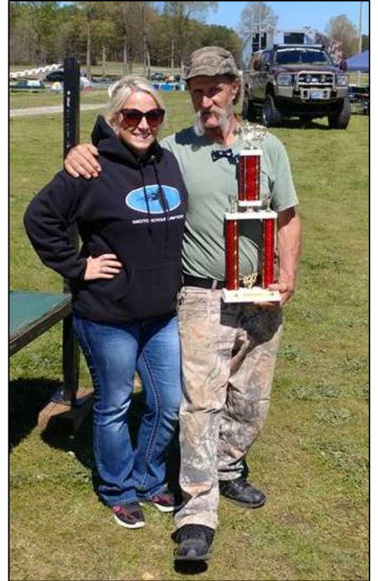
Bike Show Winner!