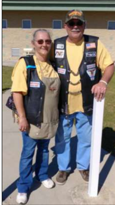
Top Volunteers - The Larkos